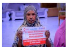
WhatsApp Image 2023-10-05 at 14.40.33_401a634c