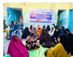
WhatsApp Image 2023-10-05 at 14.40.33_bcca5e61