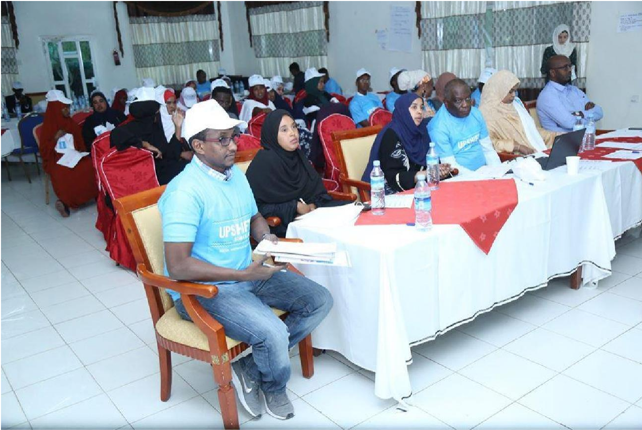
Figure 1 Boot camp workshop with the UNICEF Somaliland Head of office and CP Chief of section

With the support of UNICEF, WAAPO has begun the implementation of the UPSHIFT Innovative Livelihoods Program (a youthsocial innovation programme) to provide income opportunities SGBV female survivors and provide them opportunities for their own economic development of social enterprises for their economic empowerment.